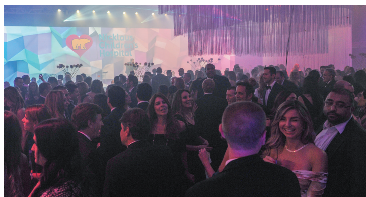
Diamond Ball guests mingling at the October 2018 gala.

More than 550 of the most philanthropic members in our community came together on October 27 to celebrate the 12th Annual Diamond Ball: Beyond Tomorrow at the JW Marriott Marquis Miami. The event raised over $1 million to benefit the children and families cared for at Nicklaus Children's Hospital.